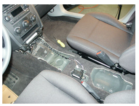
View of trak removed